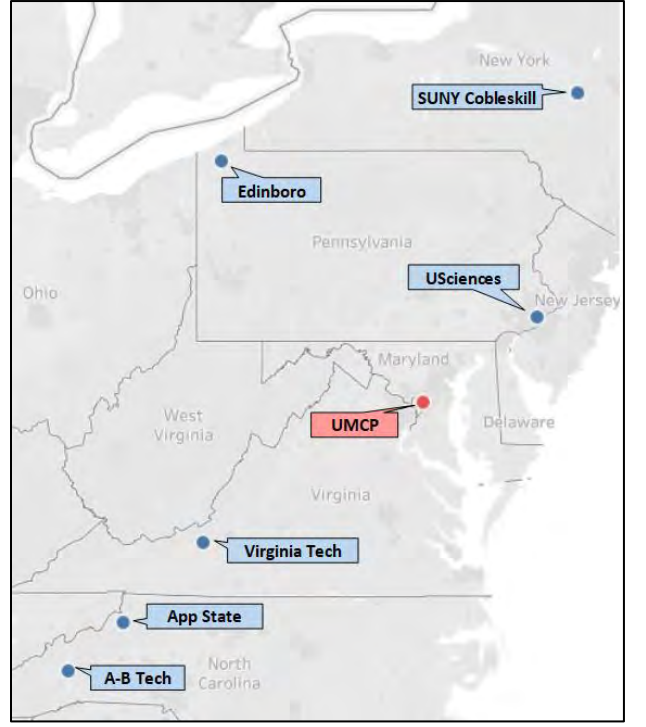
Figure 8: Map of Program Locations within Regional Proximity of College Park